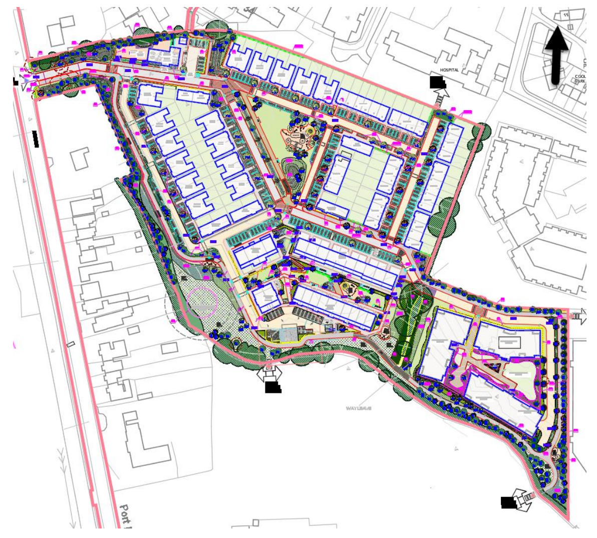
Figure 3 – Proposed Interim Site Layout