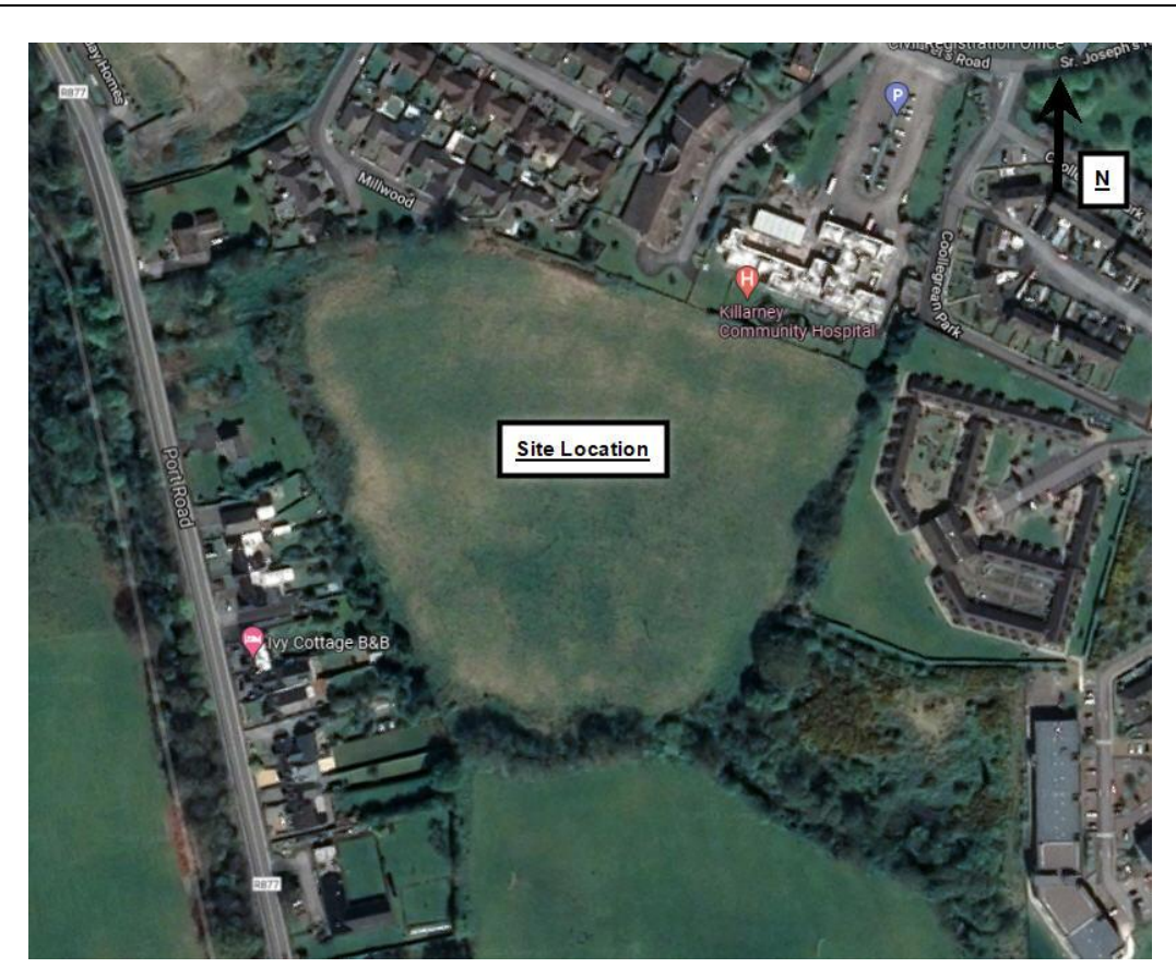
Figure 2 – Site Location